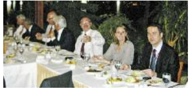
S&B hosted a dinner for the customers of many local foundries