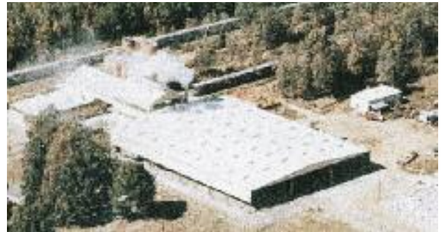
Panoramic view of the plant in Aberdeen

lead to an exothermic reaction, once the materials are applied to the liquid steel in the ingot. This helps to avoid the cavity formation in the ingots and to increase the