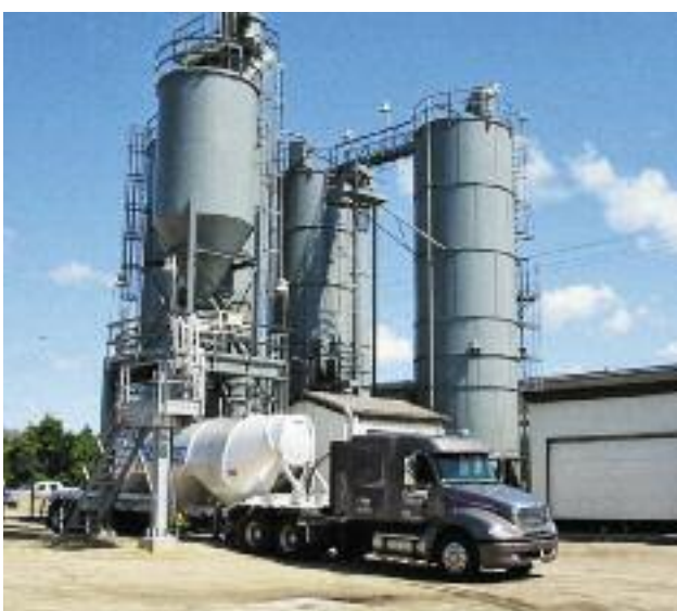
View of the plant in Waterloo