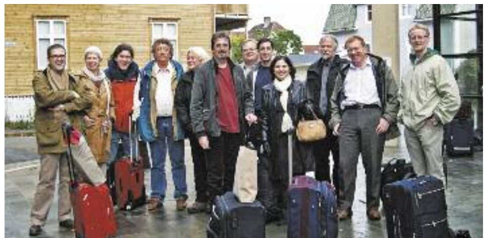
Participants of the EMF Workshop in Norway

sentatives from museums in Britain, Croatia, Greece, Iceland, Norway and Portugal. At the workshops organized during the interactive conference according to EMF methodology, round-table discussions dealt with issues concerning not only the role of museums within the framework of cultural life on the islands, but also their presence as hubs of lifelong learning. Climate change and the problems arising from its various manifestations in archaeological and cultural monuments also loomed large, while the social responsibility of museums towards local societies and tourists-visitors was discussed in great detail, in or-