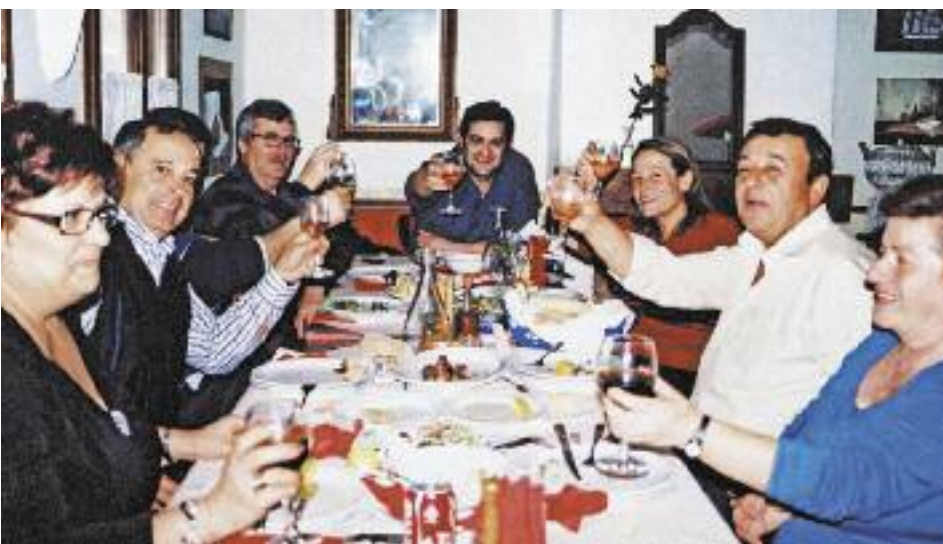
MILOS: Retirees of the year 2008 saying goodbye at banquet in Pollonia