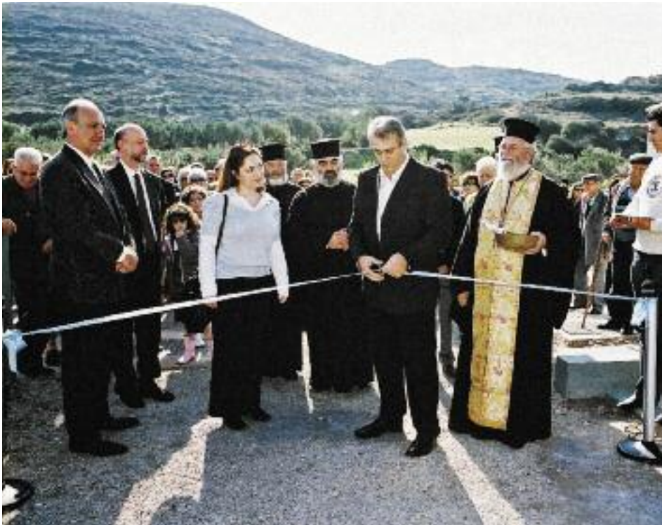
The Mayor of Milos cutting the ribbon during the opening ceremony of the biological cleaning plant

Construction of the Biological Wastewater Treatment Plant at Aghia Styliani on Milos was finally concluded, and on Sunday, 18 January 2009, the plant was formally delivered to local authorities and set in trial operation. It represents a highly significant infrastructure development, of great value to the island, and also the first activity of the developmental company titled MILOS Initiative S.A. , so that a long-standing problem of waste management on the beautiful island of Milos can finally be resolved. MILOS Initiative was founded in autumn 2007 by the Municipality of Milos, through the Municipal Developmental Corporation, and S&B Industrial Minerals S.A. Its aim is to act in support and in complement of other already existing structures, in order to pro-