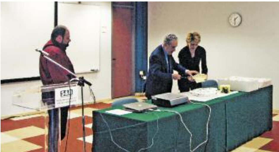
FOKIDA: The Vice-chairman cutting New Year cake at the bauxite mine