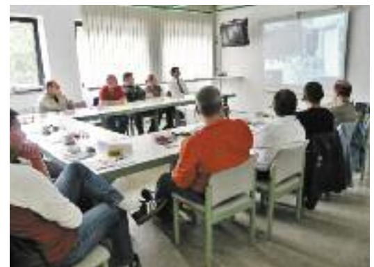
The seminar included both theory and practice