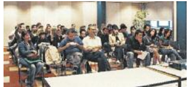
Students from the Technical University of Crete during the presentation at the education hall

On Thursday, September 25, 2008, a group of 50 students from the Mineral Resources Engineering Department of the Technical University of Crete visited the bauxite mine of S&B Industrial Minerals S.A. in Fokida, accompanied by three of their professors. The visit included a brief presentation of the mine and its activities, a tour of the “Kleisoura” underground deposit, as well as open pit sites and land reclamation areas. In conclusion, they also visited the company’s loading facilities in Itea.