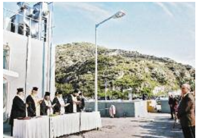
The islands' clergy blessed the first infrastructure project by MILOS Initiative at the opening ceremony