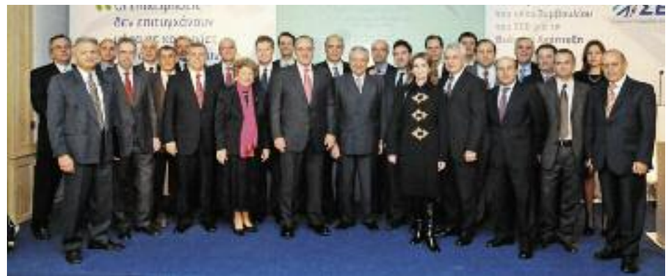
Representatives of companies-founding members, SEV Council on Sustainable Development