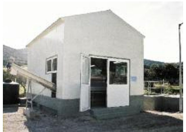
The biological waste treatment plant at Aghia Styliani