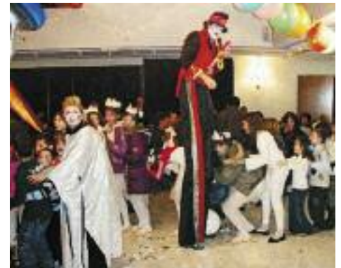
Santa in Athens with "follower", the Swan Queen dancing at the Milos Conference Center and the clown sharing the fun with children of employees at the bauxite mine

Lake as on Milos island. The performance impressed both children and their parents with its high quality and aesthetic value. What followed was an enormous feast with music, dancing, clowns at play and plenty of conjurers pulling off their tricks. At the end of this 4-hour marathon of fun for the young ones and the not-so-young-ones Santa handed out presents to all children.