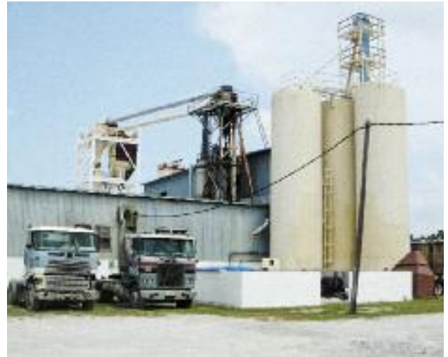
The Airlite plant

This casting technology is applied for casting special steel grades with high contents of ferrous alloys like chromium, molybdenum, niobium, vanadium etc., which cannot be produced via the continuous casting process. The products are mechanically blended like our powder shape mold and ingot fluxes, but they contain raw materials that