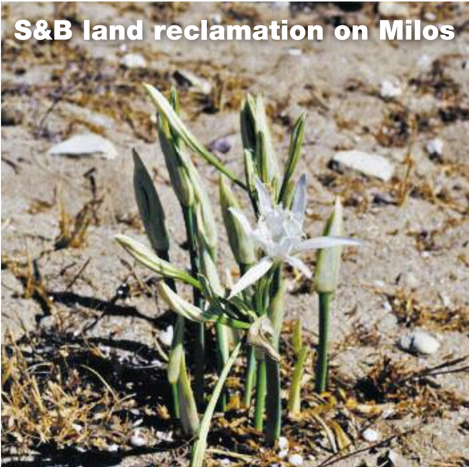
Left: The beautiful sea lily returning to its habitat, Plathiena beach Below: New hydroseeding at the Halepa mine Lawn for the Tripiti football field The interesting briefing regarding the activities of the Rehabilitation Dept. ended with colleagues expressing their wish for follow-up presentations more often in the future.